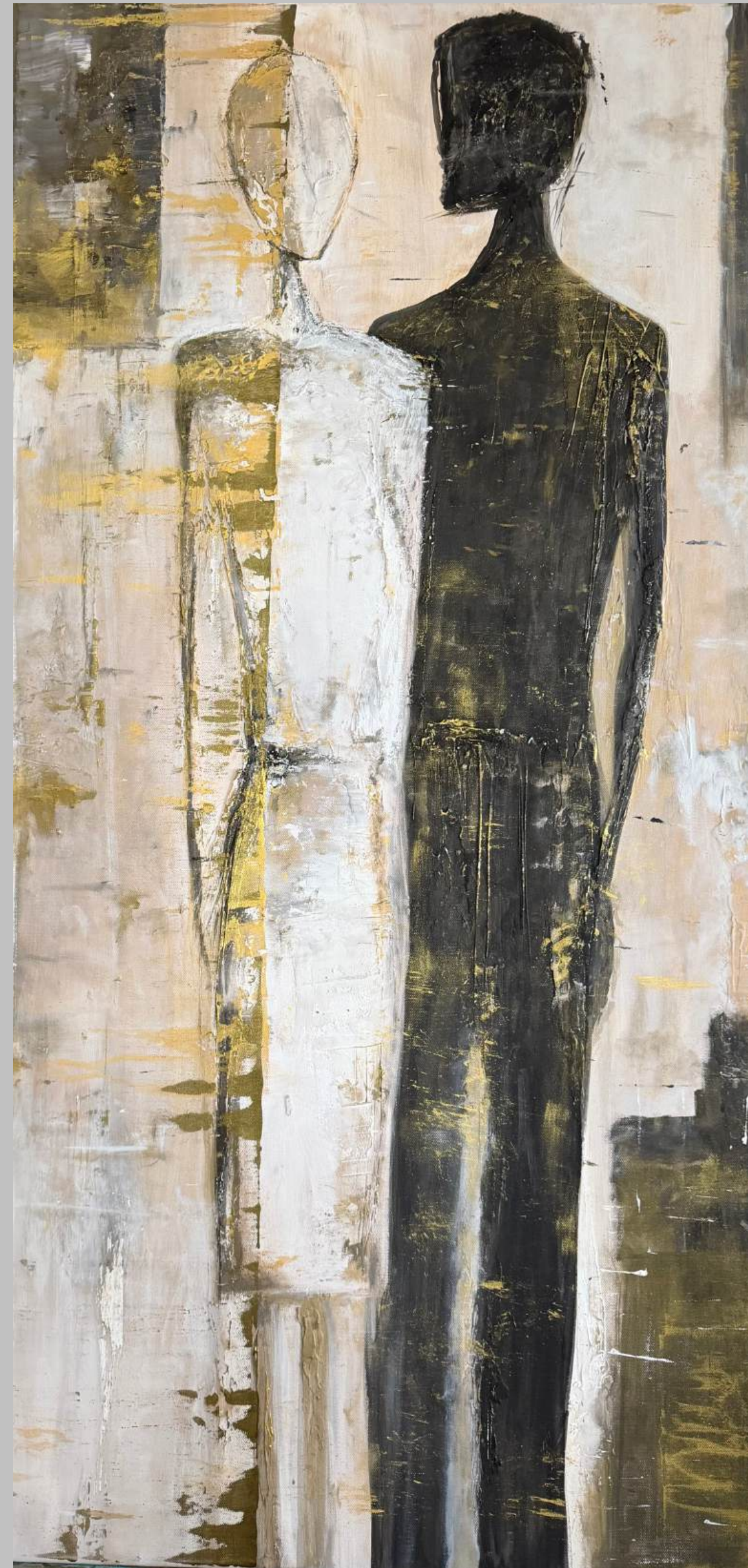
Acrylic and texture paste on canvas , size 24 x 48 , 2026

The artist employs a refined, minimalist palette of white, black, and beige, punctuated by dynamic gold accents that lend the composition a nearly metaphysical dimension. Elongated, anonymous silhouettes suspended in space build a tension between the seen and the unseen, symbolizing a search for balance within the duality of existence. The heavy, layered texture applied via palette knife provides a sculptural depth and authenticity, establishing the work as a commanding focal point for any contemporary interior. It is a mature offering for collectors seeking both aesthetic minimalism and a profound, universal symbolism in contemporary art.