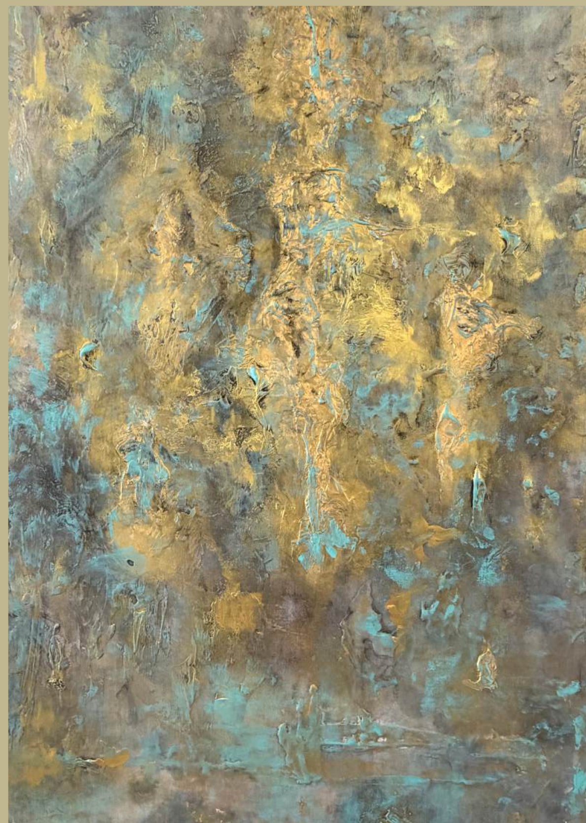
Acrylic and texture paste on canvas , size 30 x 40 , 2026

It fits naturally into interiors where quality, harmony, and attention to detail matter.