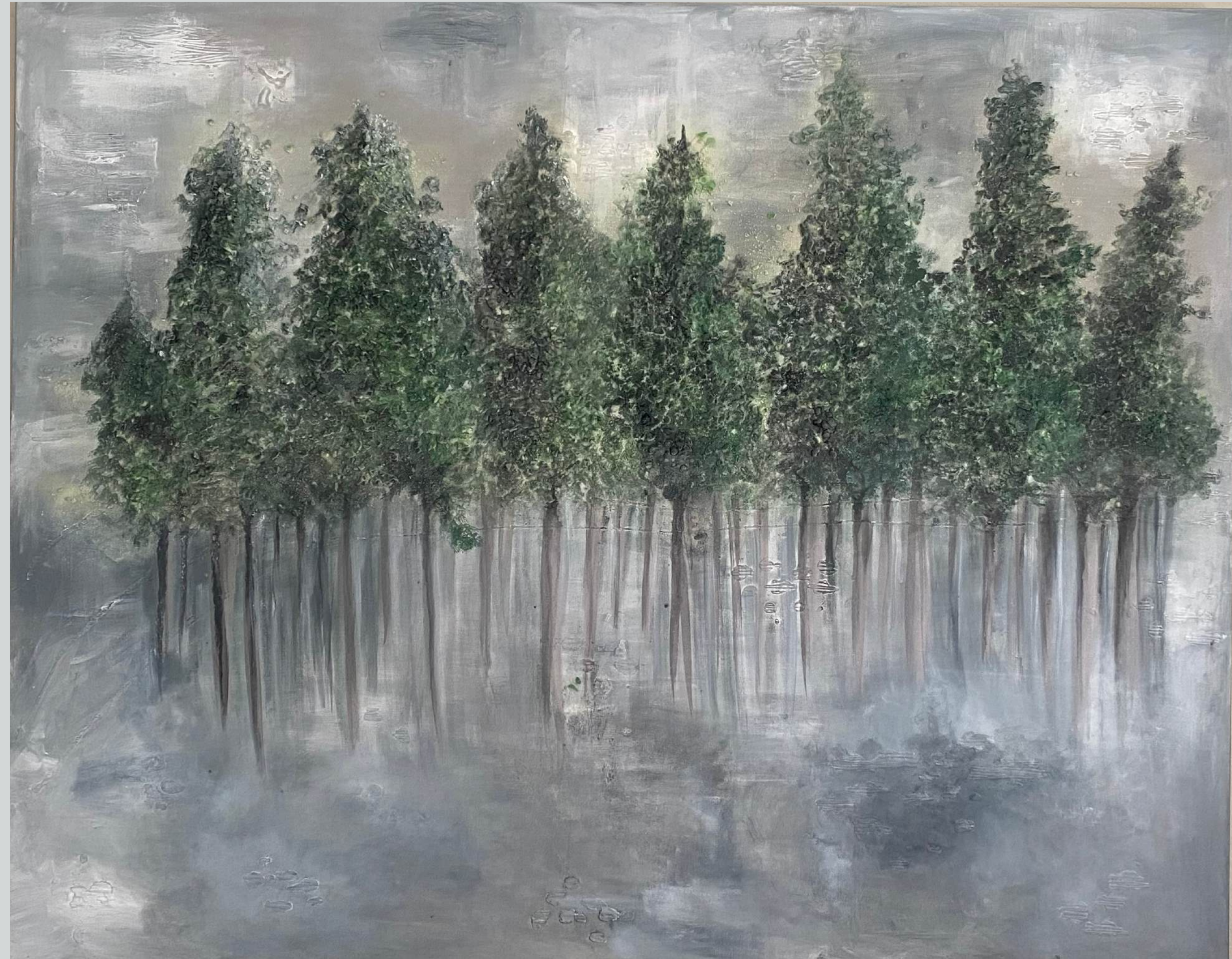
Acrylic and texture paste on canvas , size 60 x 48 , 2024